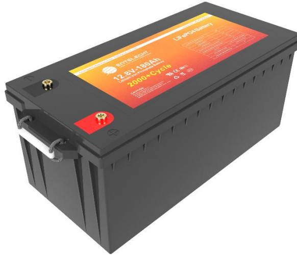
12V180Ah Battery outside picture

4.3.1 Battery bag outside picture (522*240*218mm without handle; tolerance class: GB/T1804-M)